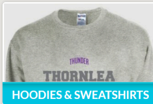
HOODIES & SWEATSHIRTS